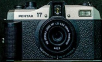
The film camera redeveloped