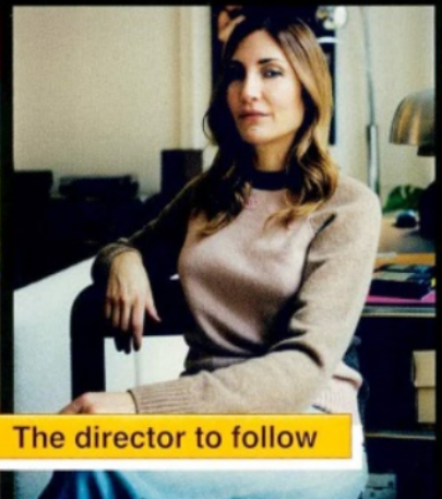
The director to follow

0.2 UK £10 USD $20 DKK 139.95 FIN €15 AUD $25.00 (incl GST) SGD $25.00 (incl GST) DE/AT €15 BENELUX €15 CAD $22.00 (incl GST) CHF 17 JPY ¥2,700 (incl GST) ES/IT €15