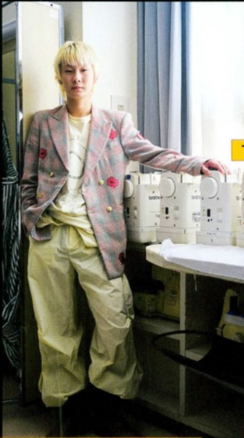
Japan's hottest fashion school