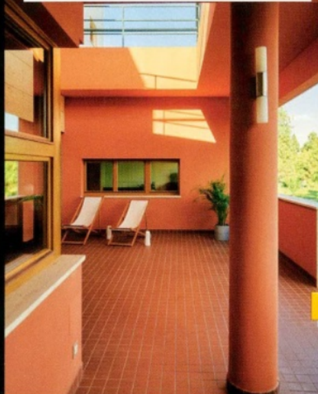
A new take on modernism