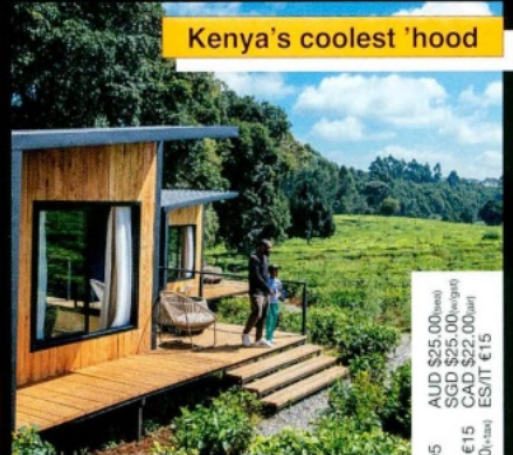
Kenya's coolest 'hood