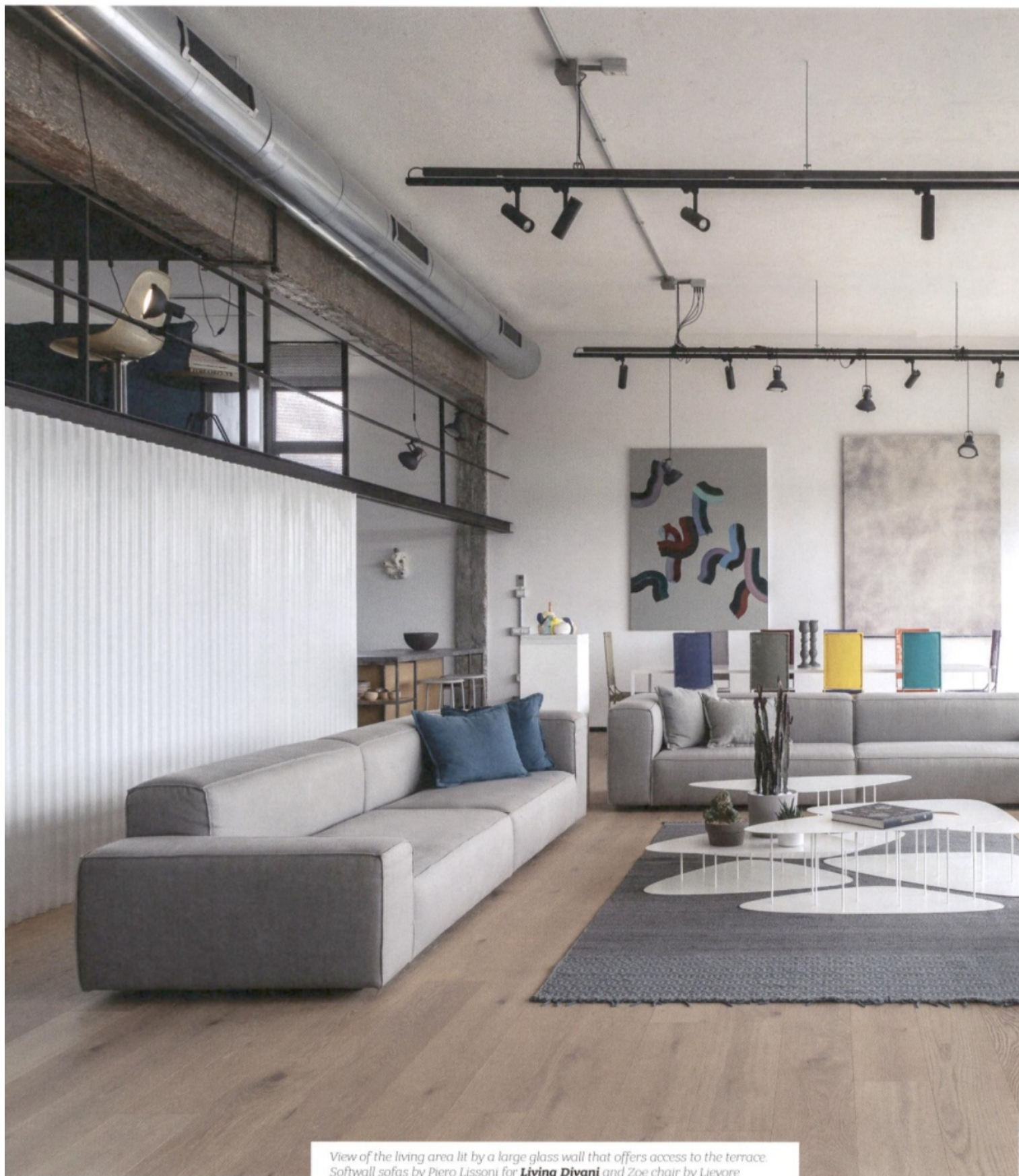
View of the living area lit by a large glass wall that offers access to the terrace. Softwall sofas by Piero Lissoni for Living Divani and Zoe chair by Lievore Altherr Molina for Verzelloni. Right, the entrance corridor organized as a gallery for part of the art collection.