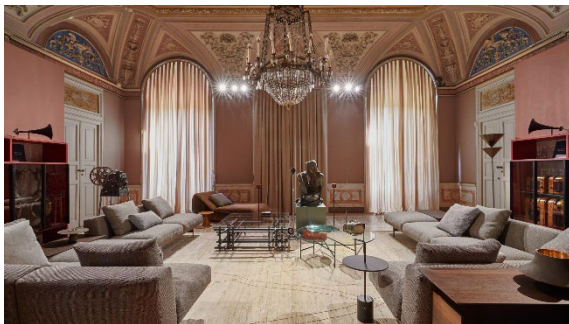
GAM, "La casa dell'architetto"