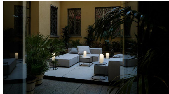
Atlas Concorde Studio Milano

In addition to its presence at the fair, the 2024 edition of the Salone del Mobile.Milano once again saw Living Divani products furnish the Red Lounge, whose set-up project was curated by Studio Lissoni. Numerous models were chosen to characterise this space, including the Confident and Gray armchairs and Kiwi and Ile Table tables. For the Salone Satellite, on the other hand, two large and refined Pasticca compositions have been selected, upholstered furniture designed by Piero Lissoni, perfect for relaxation and conversation.