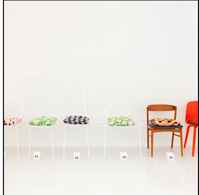
100 Cuscini x 100 Sedie