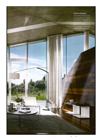
Arquitectura y Diseno (E)