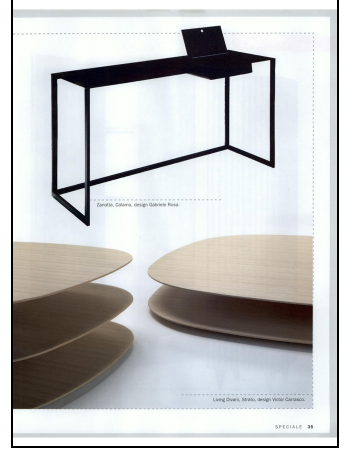
La Mia Casa (I)