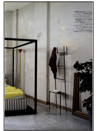
Grazia Casa (I)