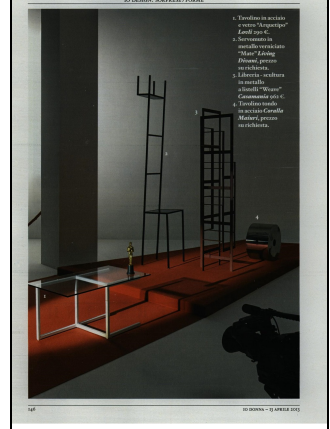
IO Donna (I)