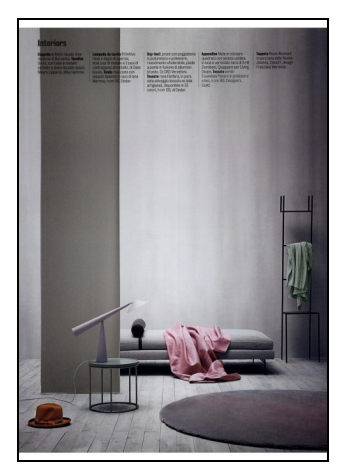
Case da Abitare (I)