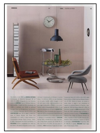
Brava Casa (I)