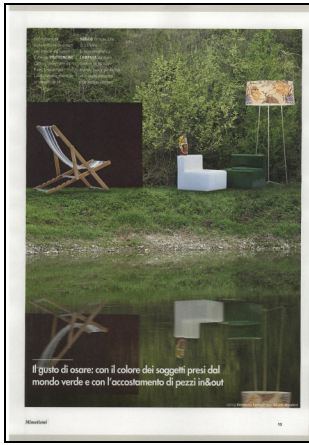
Brava Casa (I)