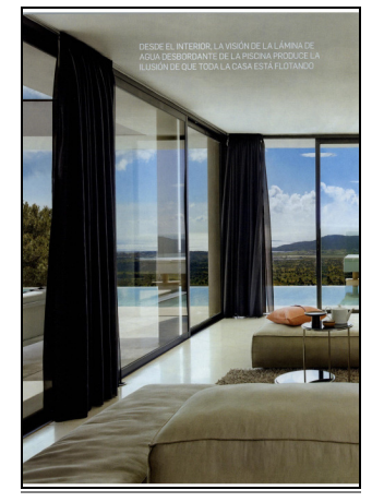
Arquitectura y Diseno (E)