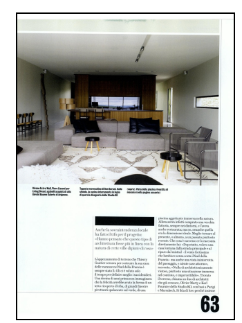
Case da Abitare (I)