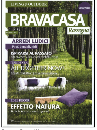
Brava Casa (I)