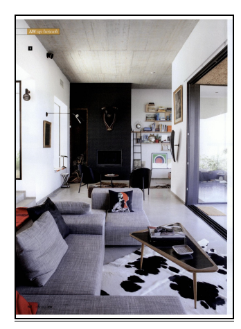
Actief Wonen (NL)